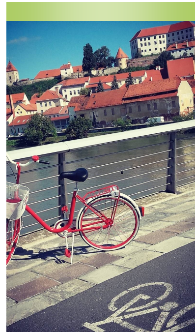
(Pictured above: Biking through Ptuj, Slovenia)

DETOCS contributes to EU Cohesion Policy, and specifically to the “ Policy Objective 2 (PO2): A greener, low-carbon Europe ”, as it promotes clean and sustainable energy transition of tourism infrastructure. The four-year DETOCS project has a total budget of €1,980,883.00 , with €1,567,416.40 provided by Interreg Funds.