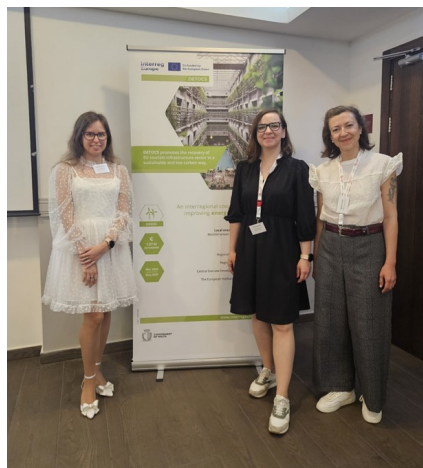
(Above) Lead Partner, LEASP, and their regional stakeholder from the Municipality of Ptuj, at the 3rd Exchange of Experience event in Malta

The DETOCS project is led by the Local Energy Agency Spodnje Podravje (LEASP) , located in Ptuj, Slovenia. At the 3rd Exchange of Experience Event in Malta, LEASP presented a potential good practice to be highlighted by the DETOCS project: Contact Point RES . This initiative gathered significant interest from other partners and stakeholders and will be showcased as a best practice in the coming months.