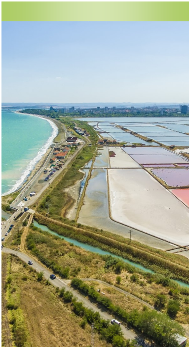
Potential solutions highlighted in Bulgaria

During the regional stakeholders' meeting of Bulgaria this August, DETOCS partners introduced and discussed with the invited stakeholders potential solutions from different regions that could become good practices and, ultimately, be multiplied in other urban areas, tourist sites and resorts.