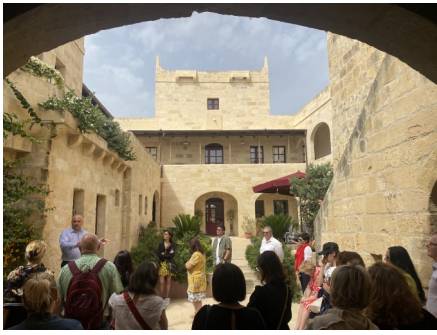
(Above) A visit to the Mulberries Guesthouse Wellbeing Chateau in Zabbar, Malta

ments of various sizes: Mulberries Guesthouse in Zabbar, the Embassy Hotel in Valletta, and the Hilton Malta in St. Julians. Following was a visit to the recently renovated Maritime Museum and concluded with an 18th Century Corsair dinner featuring local produce and ancient recipes, courtesy of the Malta Tourism Authority . On the second day of the exchange, a number of potential good practice examples were presented by all partners — including the Energy and Water Agency “GUEST” project and the TSI project of the Malta Tourism Authority—which aim to define sustainability indicators for the tourism sector.