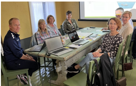
(Above) Third stakeholders’ meeting in South Ostrobothnia, Finland

In May, two stakeholders attended the Malta